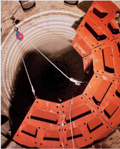
Installation of the diaphragm frame