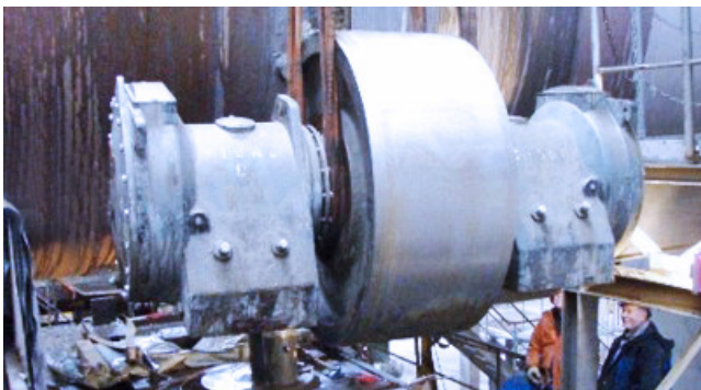
Easy mounting of the new pre-assembled polysius® roller unit onto the adapter plates.

To support the rotary kiln, each roller station requires two supporting rollers with the respective supporting roller bearings plus the associated baseplates.