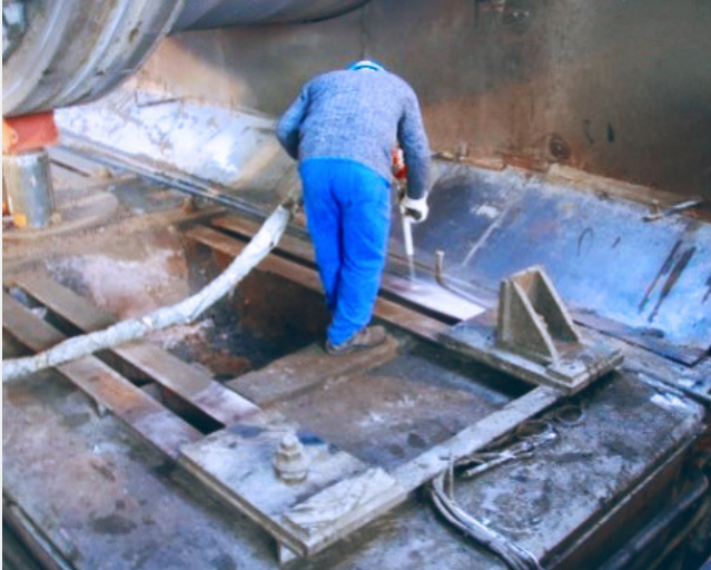
Removal of the old roller units and cleaning of the existing baseplate. No work is required on the baseplate or the kiln foundation.