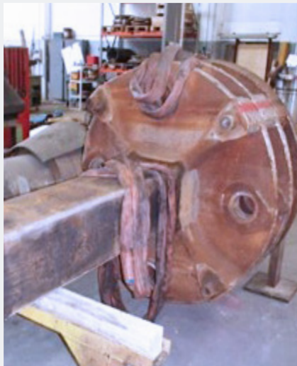
Rotor refurbishment in the Service Center Münsterland